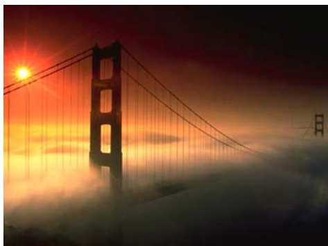
See page 7 for Annual Meeting info

Neurosurgeons face complex issues wrought by the new healthcare legislation which will fundamentally and perhaps drastically change the way we all practice surgery. Please join us at the Ritz-Carlton Hotel on Nob Hill, San Francisco Saturday, January 15 th and Sunday, 16 th as we answer the question of “The Future of Your Neurosurgical Practice After Healthcare Reform.” On Sunday we will sponsor a half day seminar addressing the implementation of Electronic Health Care records in your practice. We invite your office staff to attend the Sunday brunch-seminar at no cost to surgeons who register for the CANS annual meeting. ❖